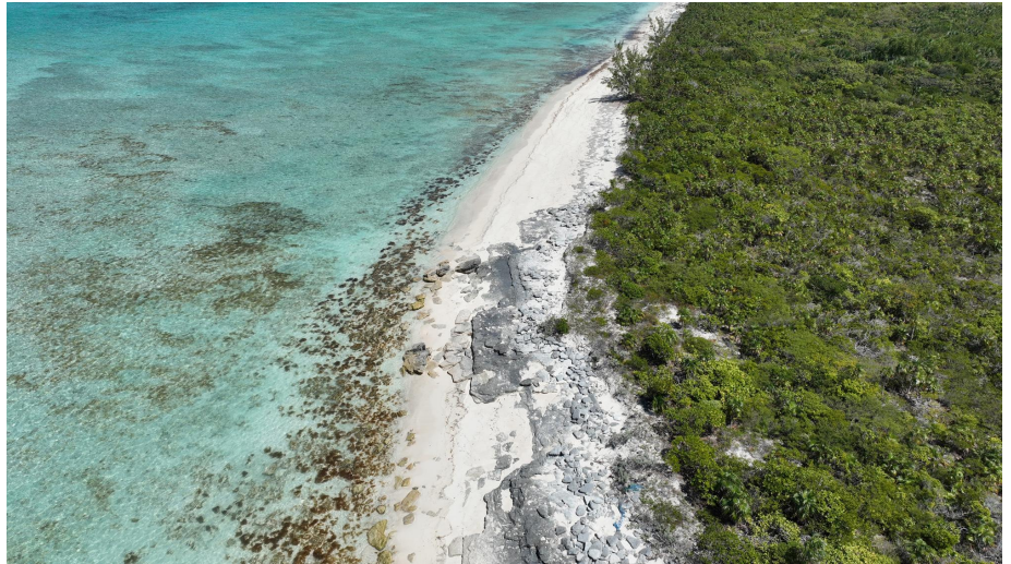
LOCATION OF PARCEL 50102 / 34 & 35 NORTH CAICOS