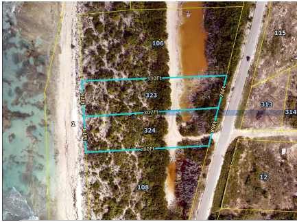
LOCATION OF PARCEL 10203 / 323 - 324 NORTH WEST SUBURBS GRAND TURK