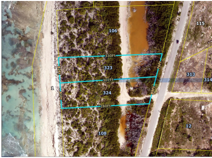
LOCATION OF PARCEL 10203 / 323 - 324 NORTH WEST SUBURBS GRAND TURK