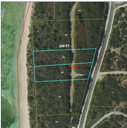
SCALE 1:500 CARTOGRAPHY DONE BY GARYL CLARKE DECEMBER 14, 2021 SITE PLAN INFORMATION & DATA SOURCE MAP ELEMENTS HATCH ROADS PROPERTY