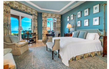
The Pinnacle on Grace Bay Suite 105