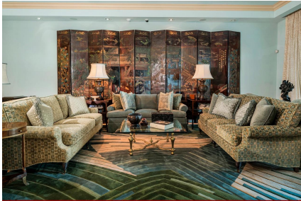
The Pinnacle on Grace Bay Suite 105