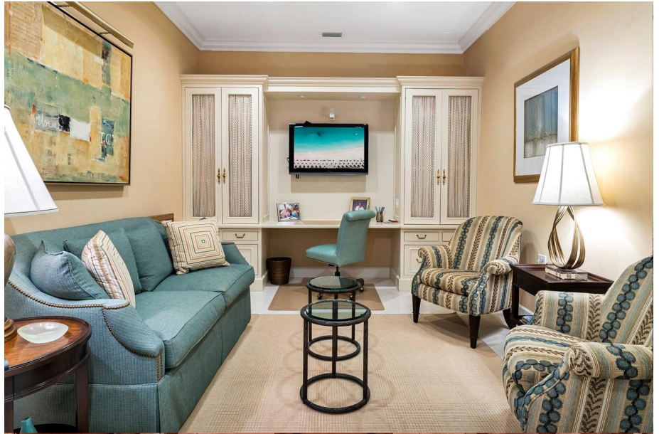
The Pinnacle on Grace Bay Suite 105