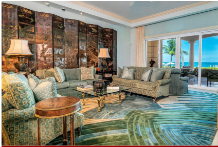
The Pinnacle on Grace Bay Suite 105