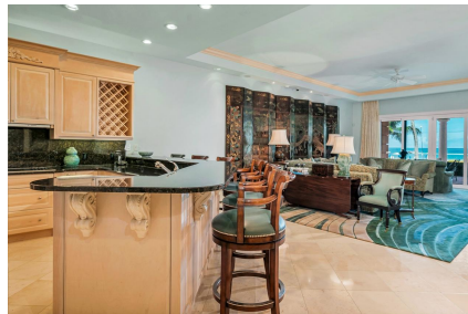
The Pinnacle on Grace Bay Suite 105