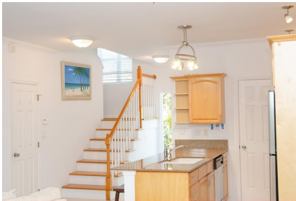
Grace Bay Townhome B2