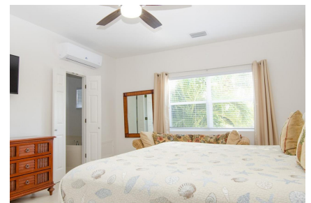
Grace Bay Townhome B2