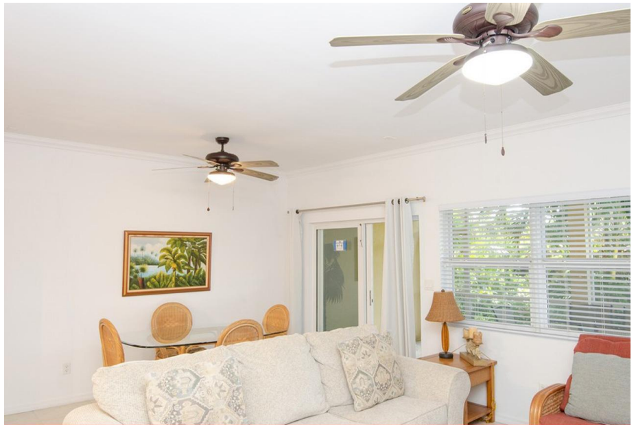
Grace Bay Townhome B2