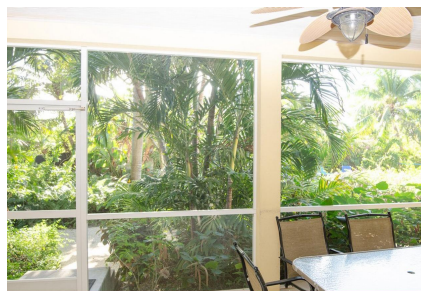
Grace Bay Townhome B2