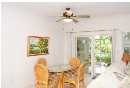
Grace Bay Townhome B2