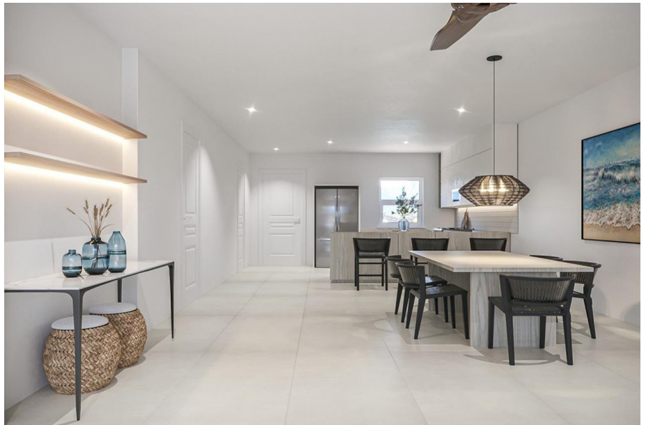
Seascape Townhomes Unit #3