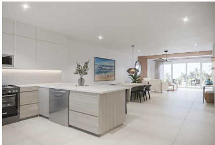
Seascape Townhomes Unit #3