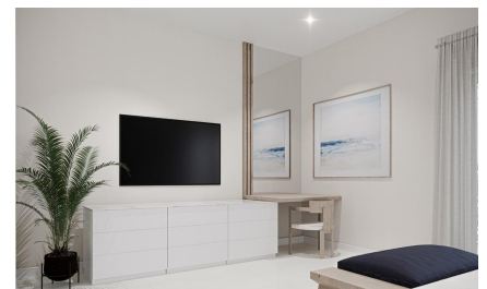
Seascape Townhomes Unit #3