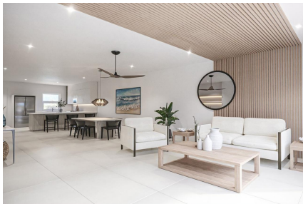
Seascape Townhomes Unit #3