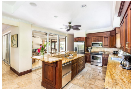
Oceanfront Villa La Percha