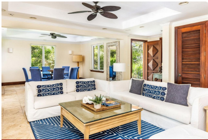
Oceanfront Villa La Percha