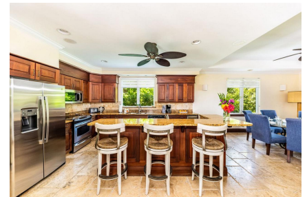
Oceanfront Villa La Percha