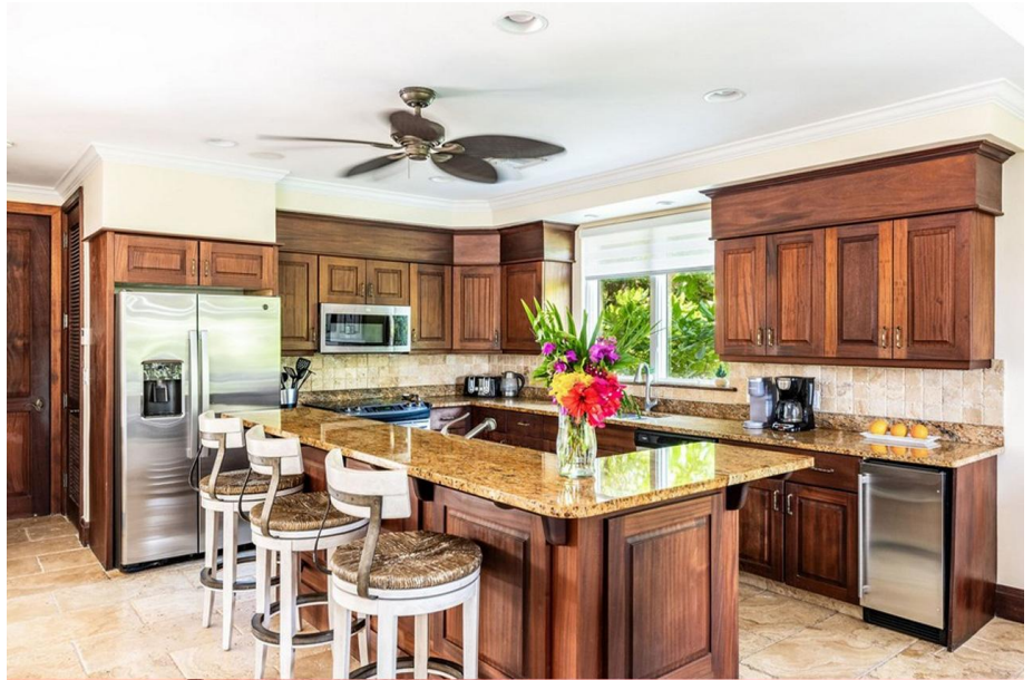
Oceanfront Villa La Percha